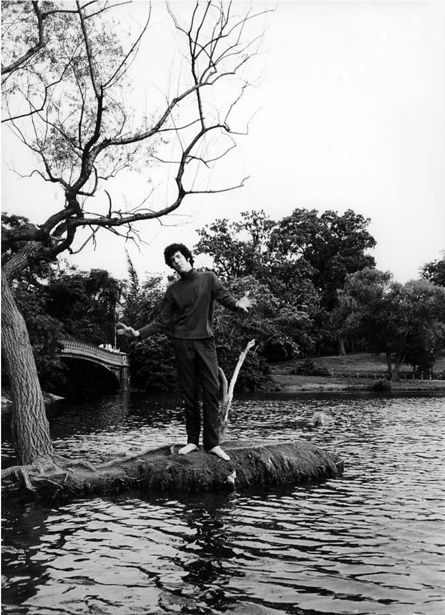
Figure 1. A youthful Warren Sonbert during the time he was a film production student at New York University.